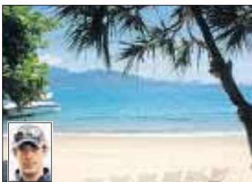
Retreats: Bruno Senna's beach and Adrian Newey's rustic scene

McLaren's Lewis Hamilton sent a snap of the cockpit of his car – 'the place where I feel more comfortable than anywhere else', he said.